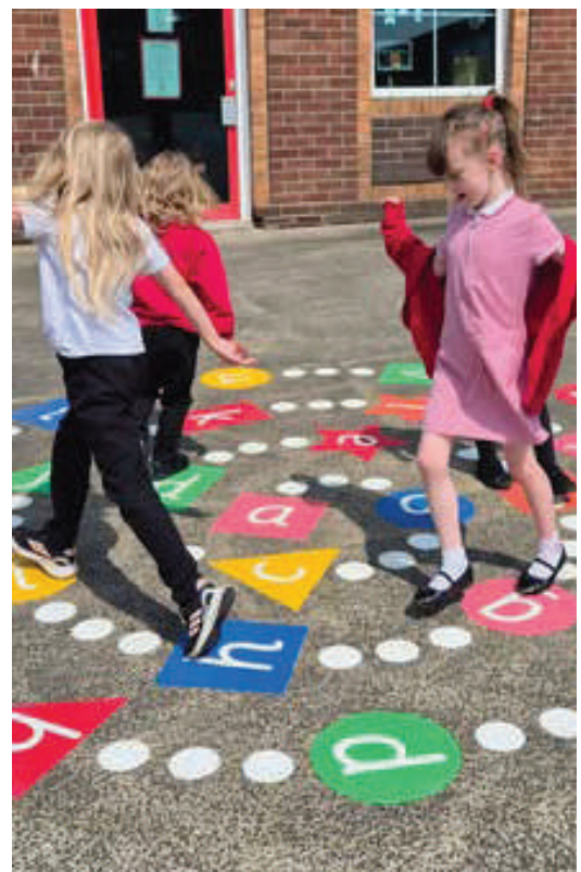
The funding we provided St Bede's Catholic Primary School in Bedlington has recently been used to add playful new markings on their KS1 and KS2 playgrounds.

West Bedlington Town Council also has a Pupils' Fund that our local primary schools benefit from. This is available to help fund things outside of a school's allocated budget, whether that's for a day trip, new play equipment, or to create an allotment for budding young gardeners. Please email clerk@westbedlingtontowncouncil.gov.uk or call 01670 457070 Monday, Thursday or Friday between 9.30am and 1pm for more information.