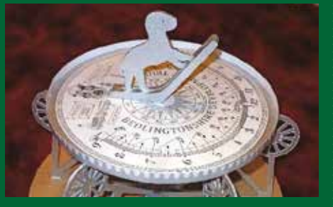
Bedlington's Quiet Man