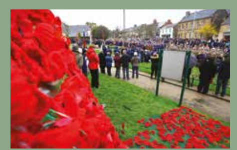
100 Years of Remembrance

Spooktacular and Other Forthcoming Events