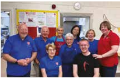
The fabulous Lunch Club team at The Salvation Army in Bedlington.

Not only can being part of a choir be a rewarding pastime, but singing has also been proven to have positive health benefits, too. Visit ashingtonmalevoicechoir.org.uk to find out more.