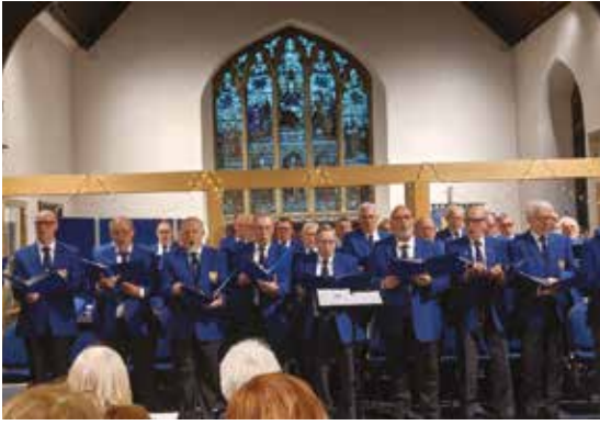
Ashington & District Male Voice Choir performing at St Cuthbert's Church, Bedlington.